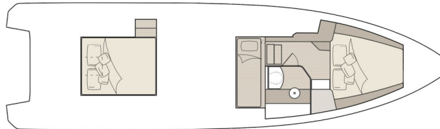
02 Lower deck with aft cabin